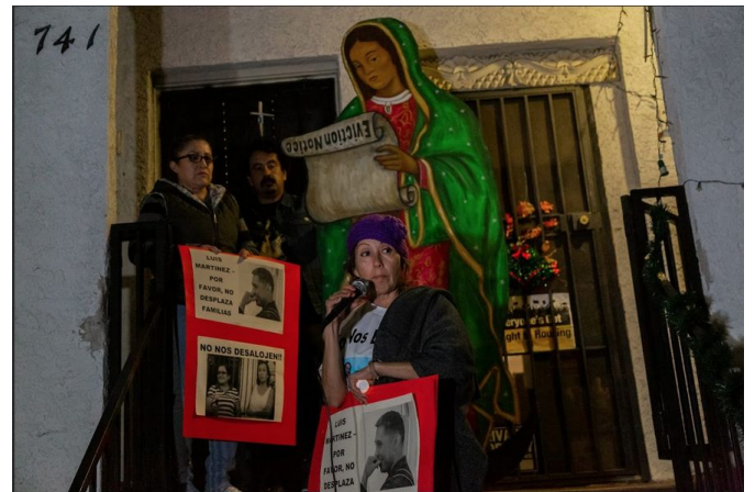
Union de Vecinos - Las Posadas en CA