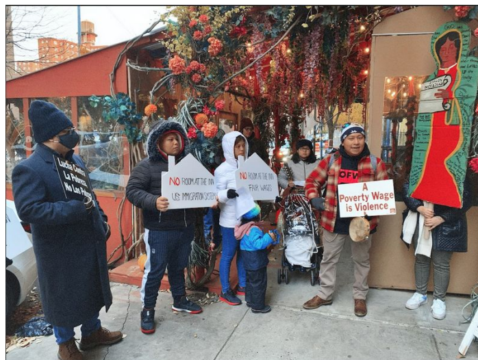
Iglesia del Pueblo + Freedom Church of the Poor Las Posadas 2023 NYC